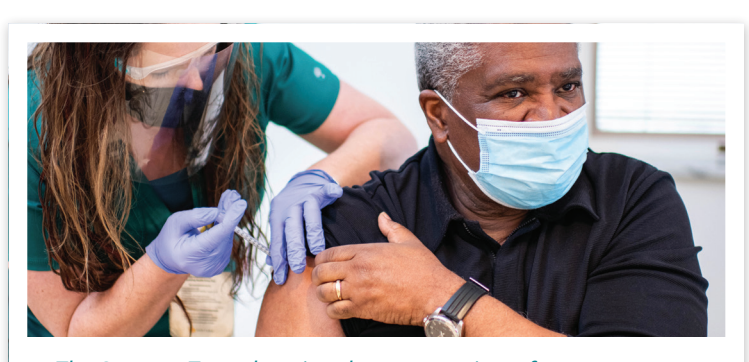
The Sentara Team keeping the community safe.

The following individuals, corporations, and organizations made gifts or pledge commitments to Sentara programs and services in honor or in memory of a physician, staff member or loved one from July 1, 2021 to December 31, 2021.