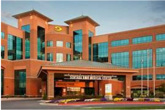
Sentara RMH Medical Center