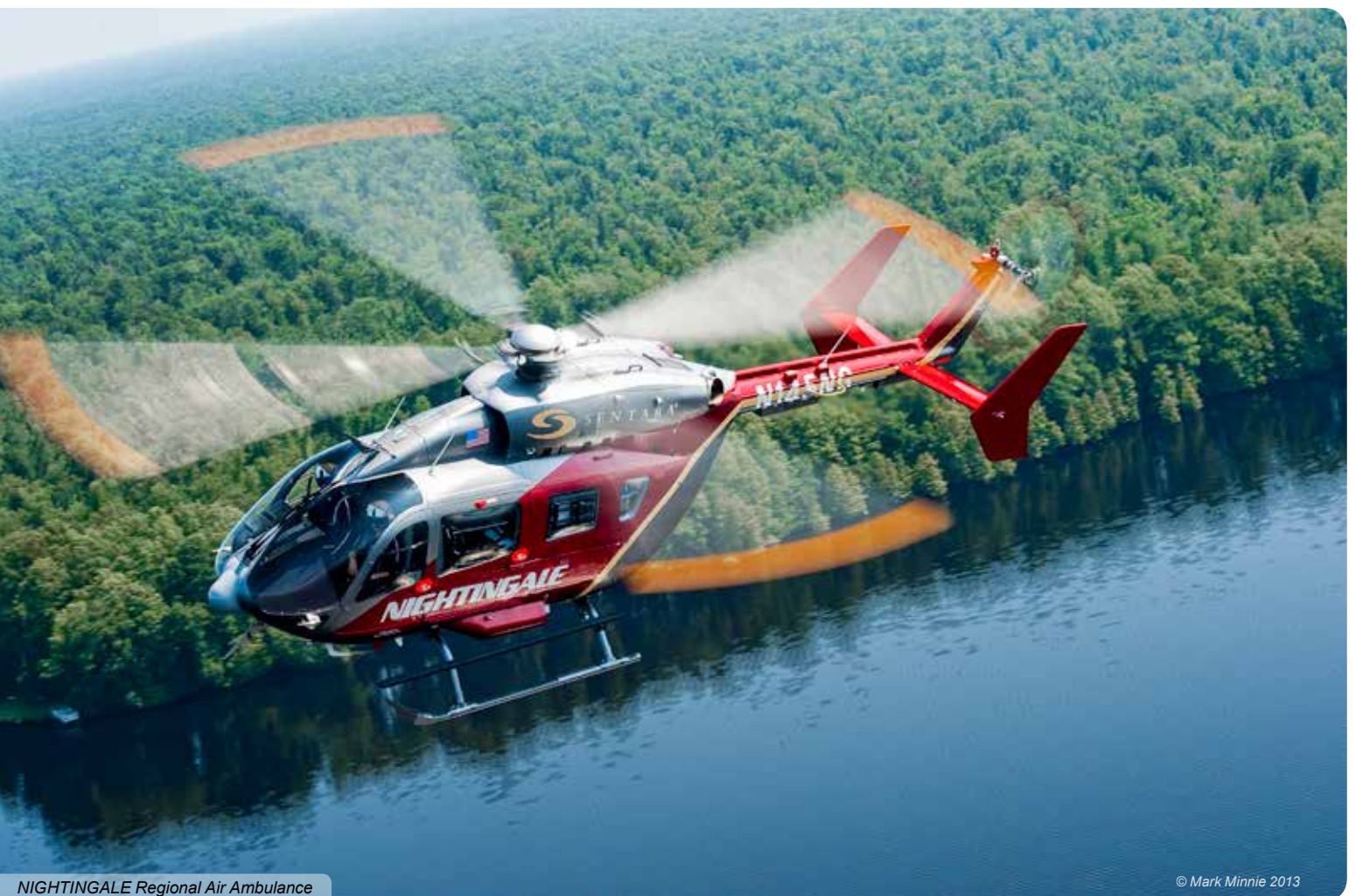
NIGHTINGALE Regional Air Ambulance

You can help Nightingale continue saving minutes and saving lives by contributing to the Sentara Foundation – Hampton Roads in support of the IFR program.