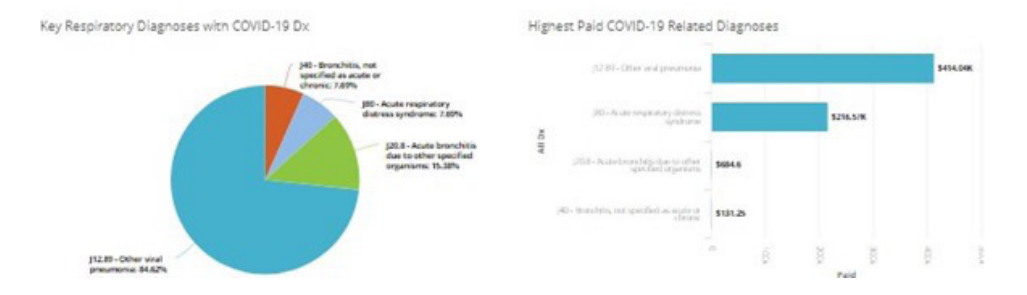
Tip: Some charts may not have data. Pharmacy within DataPoint only includes data from Sentara Health Plans Pharmacy Coverage.