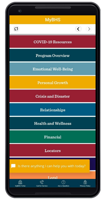
Trainings and Webinars