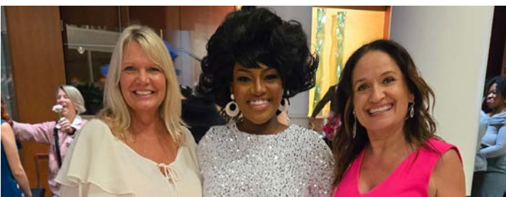
Friends of the Sentara Foundation pose with an actor from the Beautiful: The Carole King Musical (center), sponsored by Sentara.