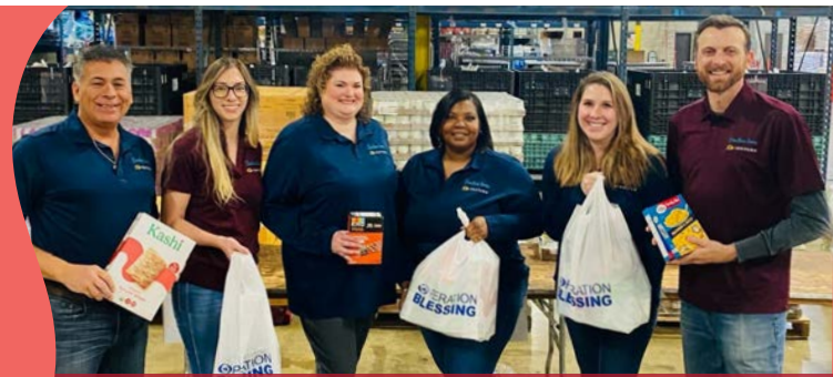
Sentara Foundation team members volunteer in the community