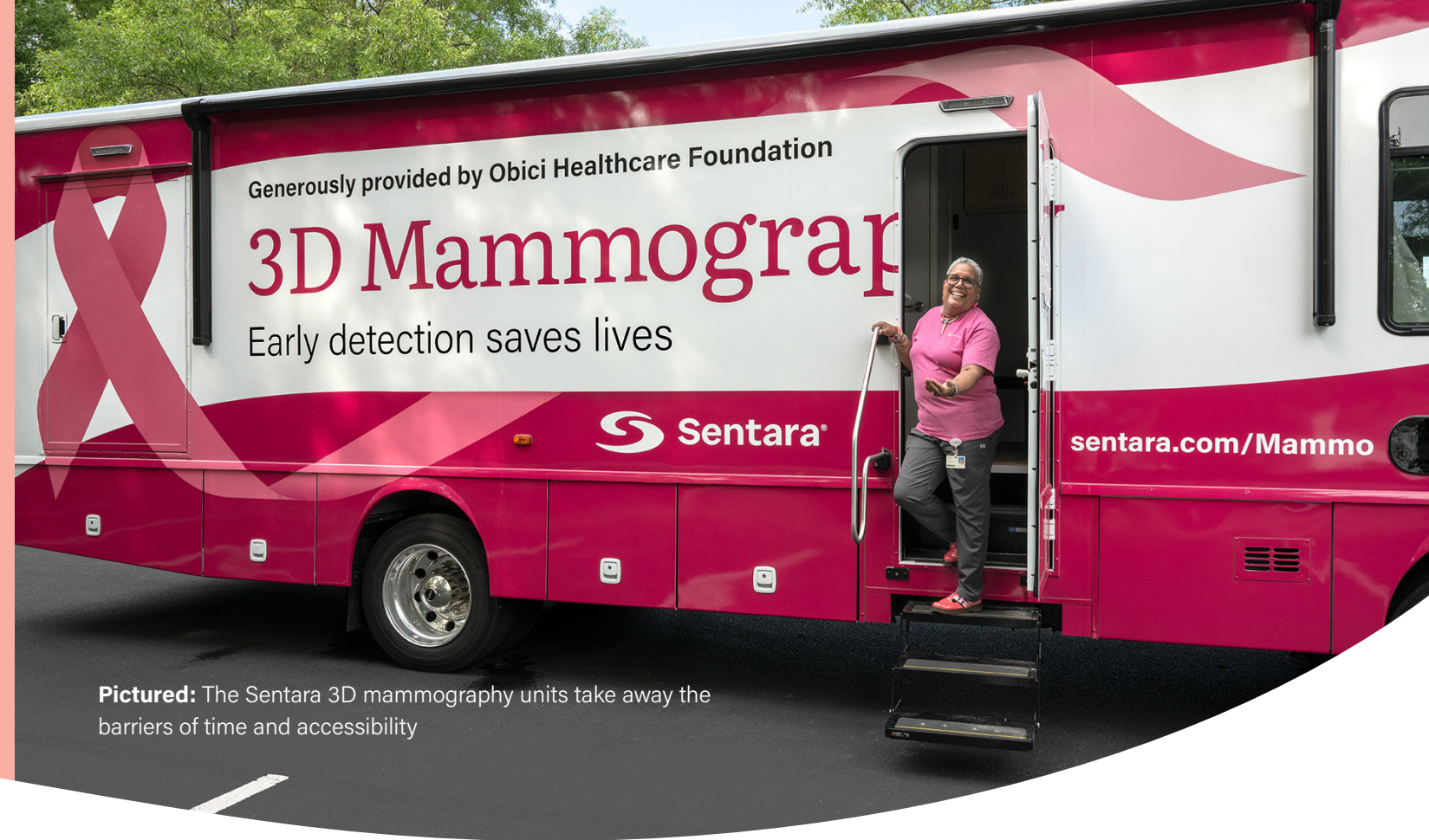
Pictured: The Sentara 3D mammography units take away the barriers of time and accessibility

“We get thanked all day long,” she says.