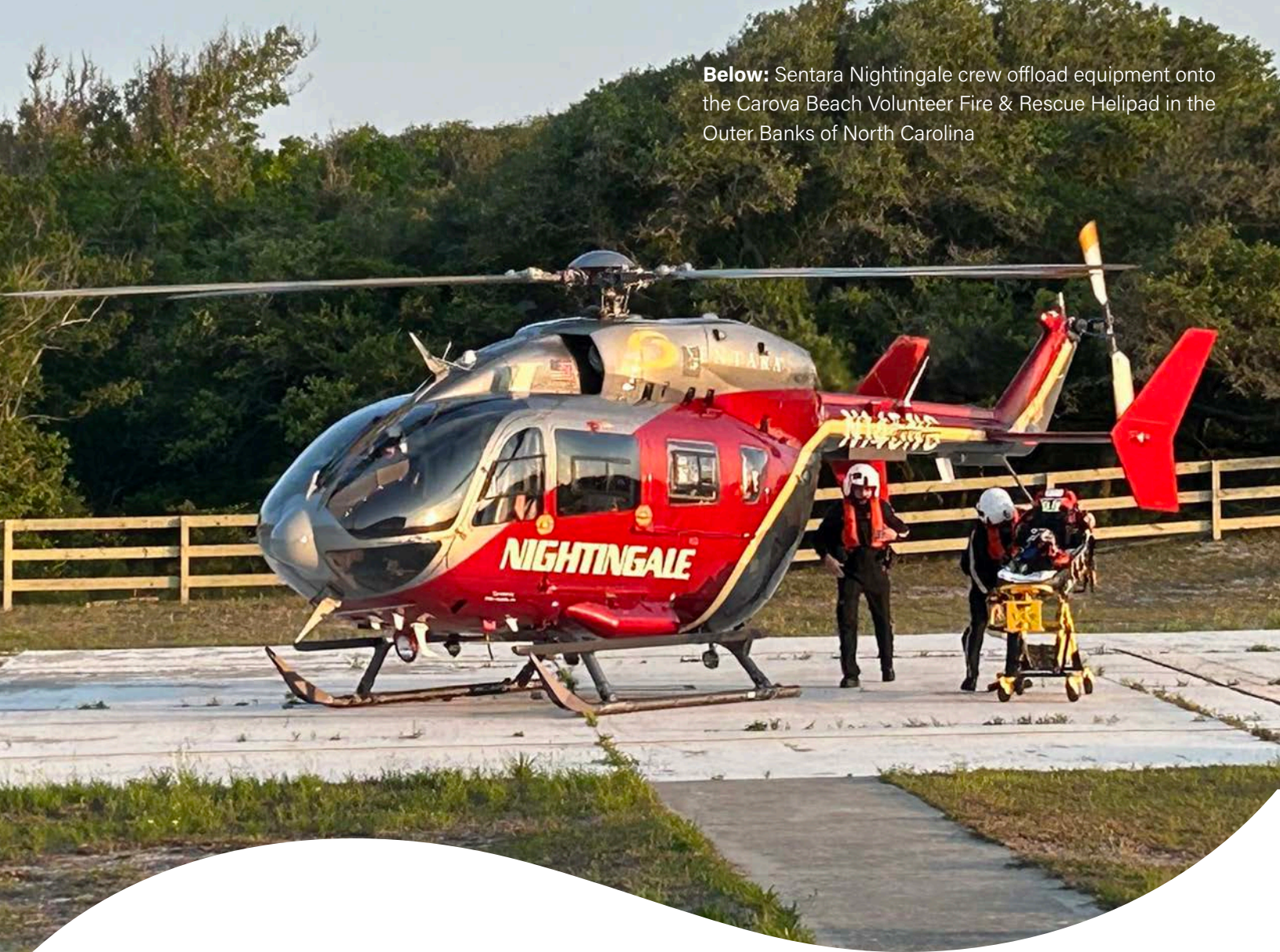
Below: Sentara Nightingale crew offload equipment onto the Carova Beach Volunteer Fire & Rescue Helipad in the Outer Banks of North Carolina