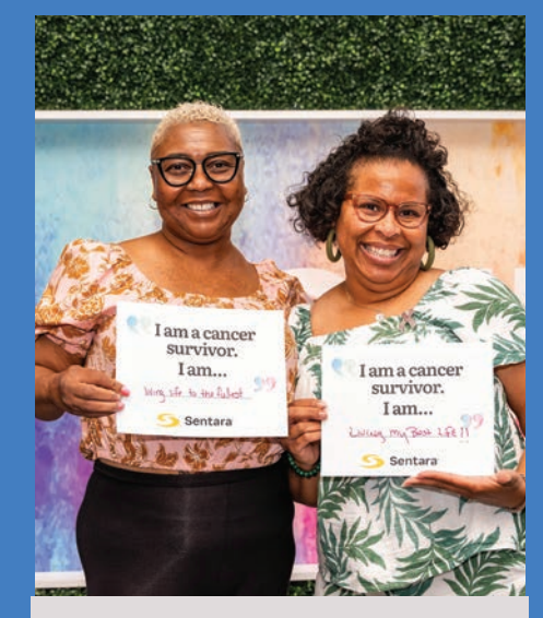
Survivors celebrated together

Attendees enjoyed a keynote address and book signing from