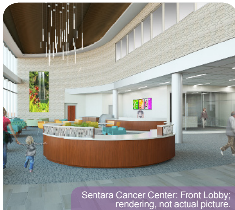
Sentara Cancer Center: Front Lobby; rendering, not actual picture.

endure multiple scans, tests, and procedures. And mostly, she didn't understand how the disease would change the relationship with friends and coworkers, family and children. She wrote of not having energy to socialize, yet it hurt when she was avoided or felt excluded by friends who just didn't know what to say. The pity, the guilt, the confusion are now her constant companions.