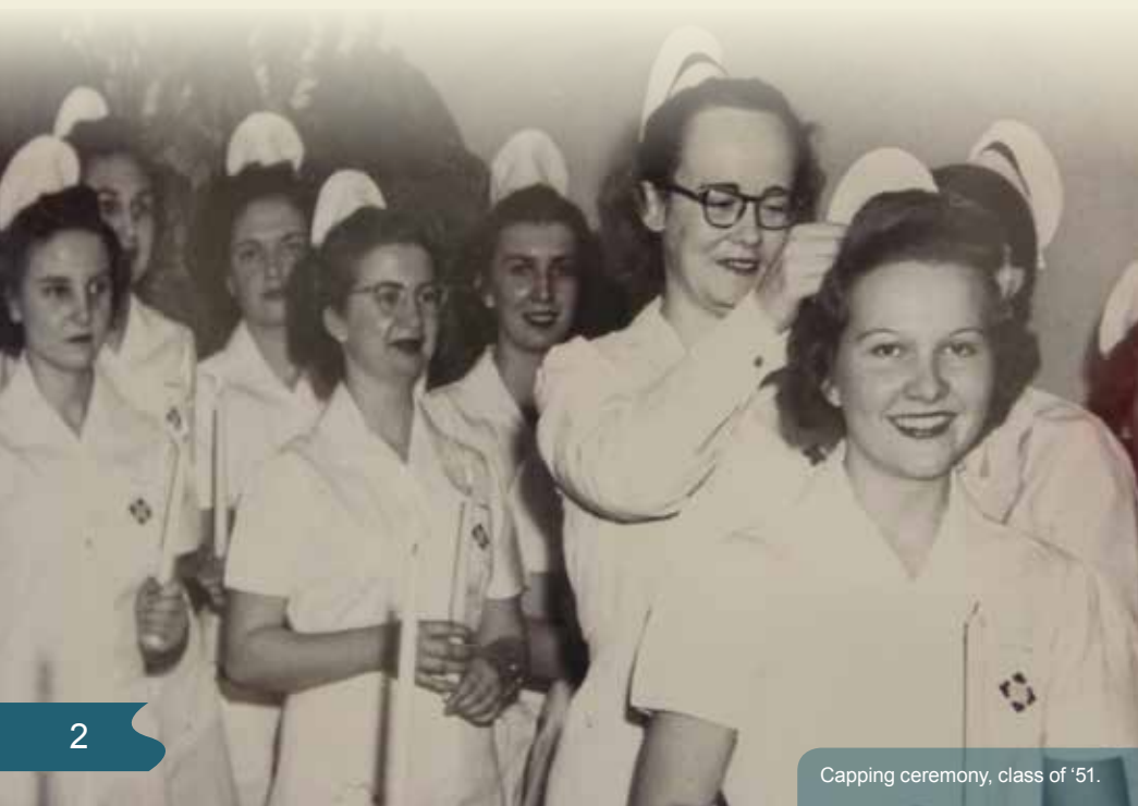
Capping ceremony, class of '51.

Your kindness today heals someone tomorrow.