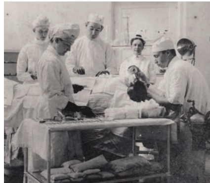
Above: An operating room at the Retreat for the Sick in Norfolk, Virginia circa 1910

Did you know Sentara traces its roots to 1888? Back then, community leaders in Norfolk, Va., pooled together $5,000 to open the Retreat for the Sick, a hospital dedicated to “care for all people, regardless of their origins or circumstances.” With just 25 beds, it was one of fewer than 200 hospitals in the country. Today, this same hospital is known as Sentara Norfolk General Hospital, and it’s ranked among the world’s top 250 hospitals (World’s Best Hospitals 2024 Newsweek Report).