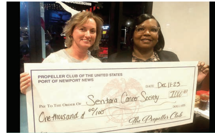
The Sentara Foundation accepts a donation from the Propeller Club of Newport News to help cancer patients in Hampton Roads