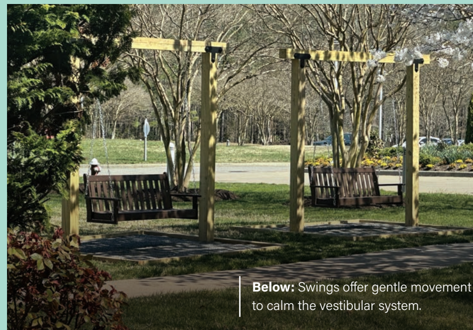
Below: Swings offer gentle movement to calm the vestibular system.

"Our goal is not only to make everyone feel welcome here, but also to make them at ease enough to receive the important care they've come to the hospital for."