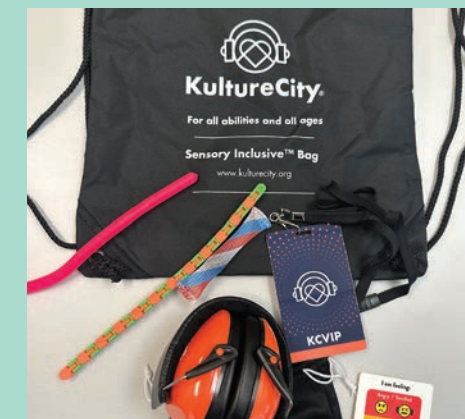
Above: Sensory bags with noise-canceling headphones, fidget toys, and a feeling thermometer (a visual tool that helps patients measure how they are doing emotionally) that patients can borrow

Around the world, KultureCity has certified more than 1,800 locations, including arenas, airports, zoos, restaurants, libraries and approximately 120 medical facilities.