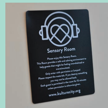
Above: Sensory inclusive signage indicates the area is designed for individuals with sensory sensitivities

Since earning the certification, Donna shares the impact becoming sensory-inclusive is already having on patients.