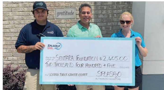
The Sentara Foundation accepts a donation from Splash2o to benefit the McLeskey Comprehensive Breast Center.