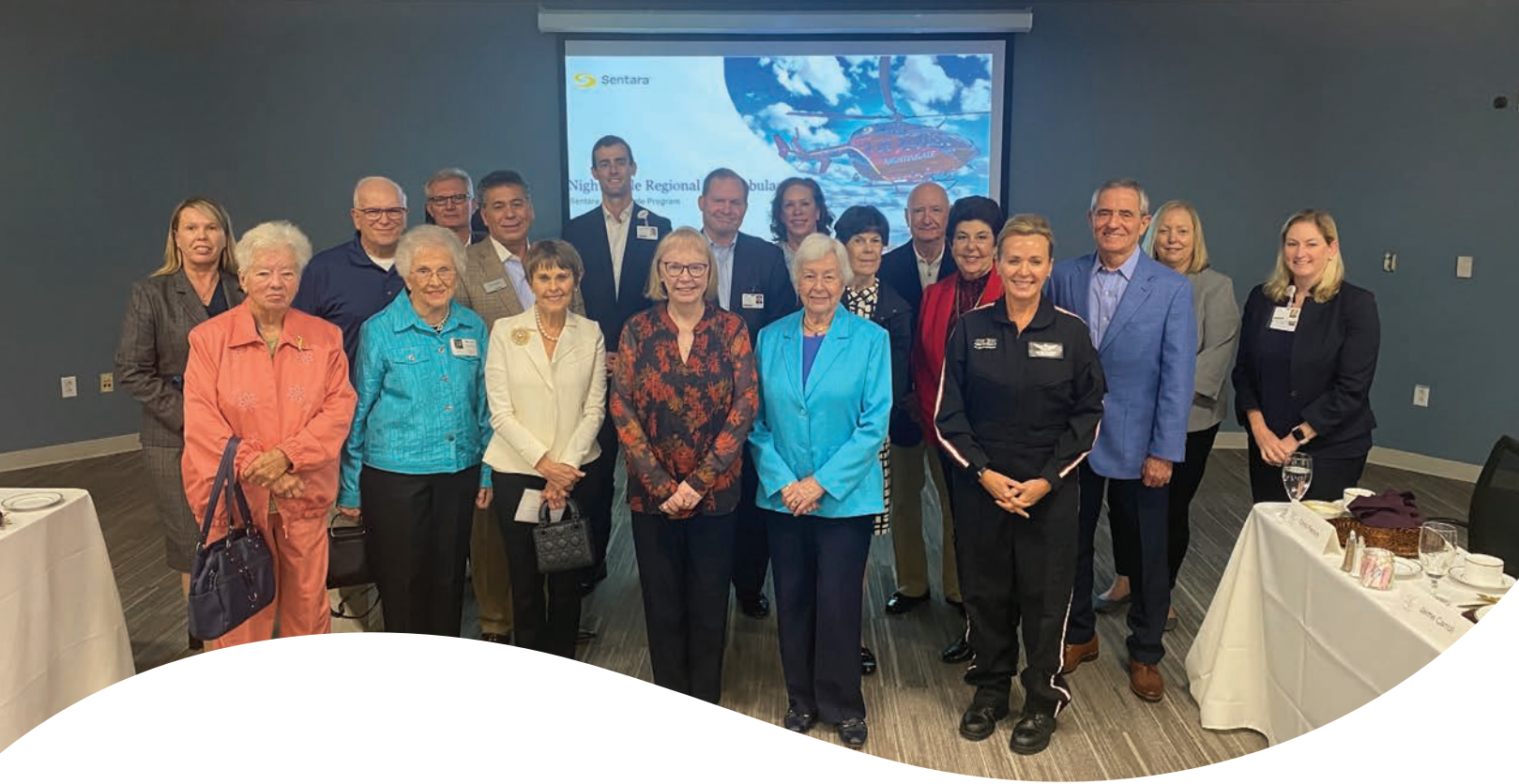
Above: Sentara Legacy Society (SLS) members met with Sentara senior leadership at the annual SLS luncheon in fall 2023.

The following individuals, corporations or organizations made gifts or pledge commitments to Sentara programs and services in cardiac, cancer, hospice, Nightingale, nursing scholarships and more from July 1, 2023-December 31, 2023.