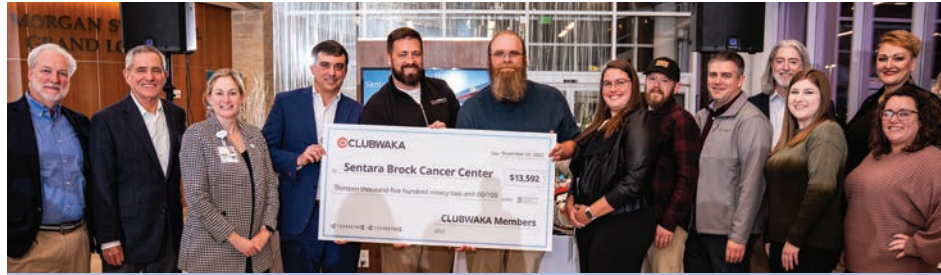
CLUBWAKA members and Sentara leaders gathered to celebrate their charitable gift to the Sentara Brock Cancer Center.