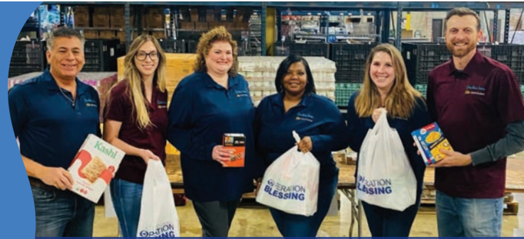
Sentara Foundation team members volunteer with local community partner Operation Blessing.