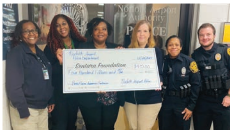
The Norfolk Airport Police Department presented proceeds from their fundraiser to promote Breast Cancer Awareness at the Sentara Brock Cancer Center.