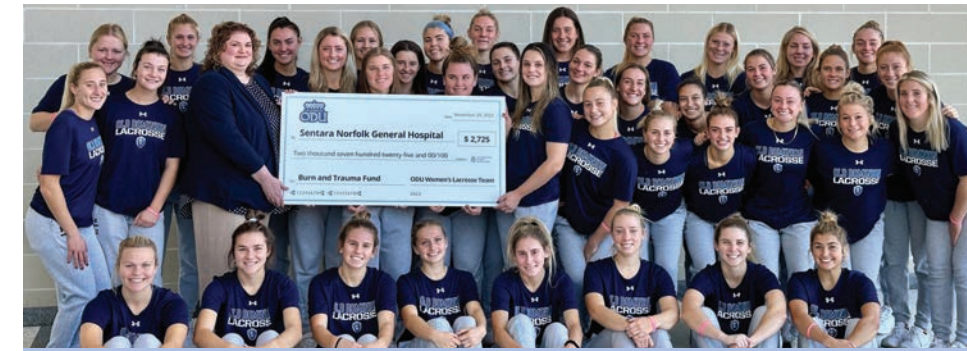
The ODU Women's Lacrosse Team presented a check to benefit the Burn Trauma Unit at Sentara Norfolk General Hospital.

To receive a FREE brochure, Planning for the Future , or to talk to us about your future plans—whether you have already included Sentara in your estate or are just seeking information, please visit sentara.com/foundation or contact us at foundation@sentara.com or 757-455-7976 .